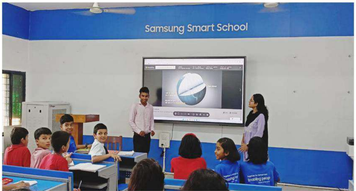
Taking classes during internship