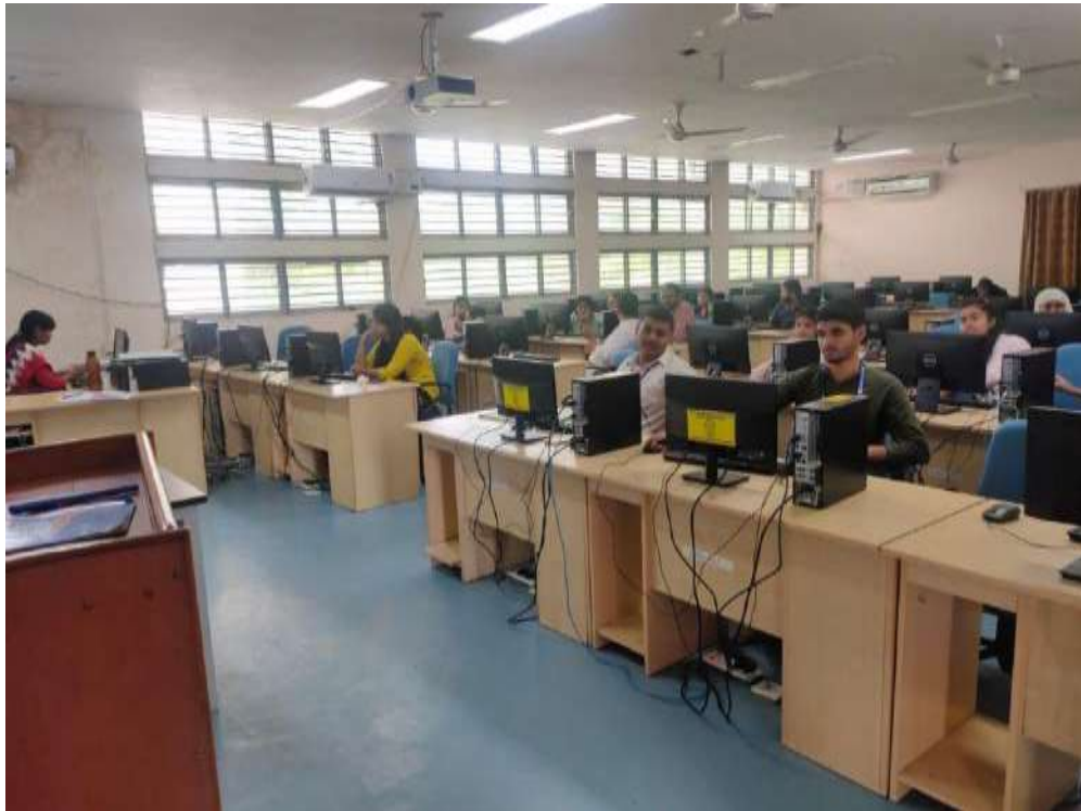
Technology leaning begins with the EPC classes where ICT its components are taught