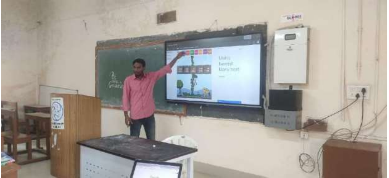
Learning to take classes by using smart classes